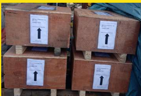
PACKING AND DISPATCH