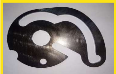
MACHINERY WEAR PART