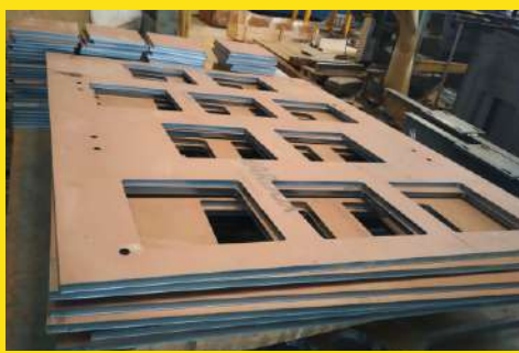
12MM CRUSHER SCREENS

YEAR ON YEAR WE HAVE INCREASED OUR CUSTOMER SATISFACTION PORTFOLIO IN FIELD OF DIRECT TO USE WEAR PARTS.