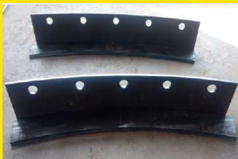
AIR SEAL GAP ADJUSTER

YEAR ON YEAR WE HAVE INCREASED OUR CUSTOMER SATISFACTION PORTFOLIO IN FIELD OF DIRECT TO USE WEAR PARTS.