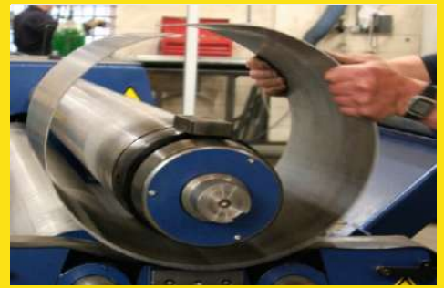
ROLLING AND BENDING (EVEN 500 BHN PLATES.)