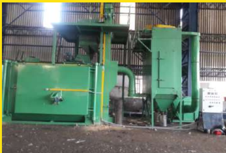
SHOT BLASTING AND COLOURING