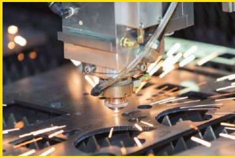
CNC CUTTING: - OXYFUEL, PLASMA, LASER, WATERJET AND SHEARING