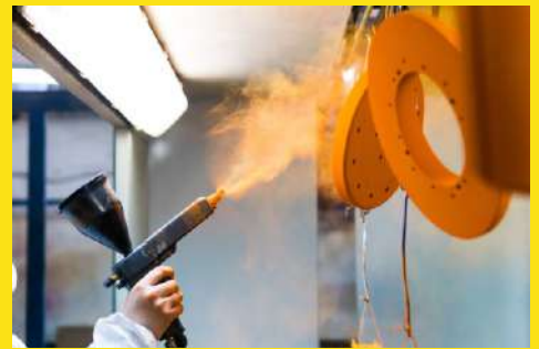
POWDER COATING AND BAKING