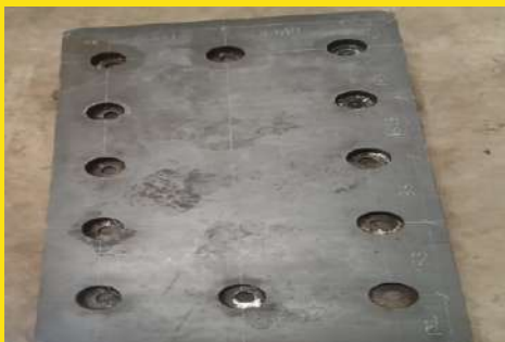
CRUSHER IMPACT PLATE