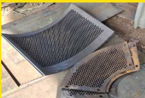
ROTARY SCREEN LINER