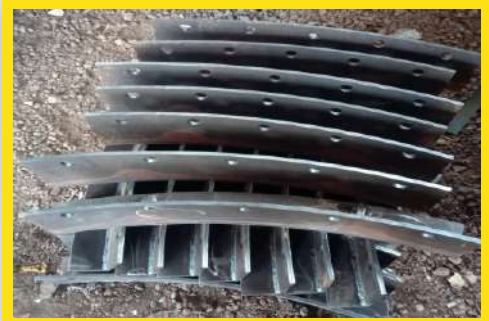
SEAL AIR GAP ADJUSTMENT FOR SEPARATOR