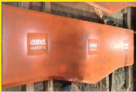
40MM 500 BHN LIP PLATE FINISHED

YEAR ON YEAR WE HAVE INCREASED OUR CUSTOMER SATISFACTION PORTFOLIO IN FIELD OF DIRECT TO USE WEAR PARTS.