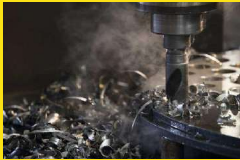
DRILLING, CSK, COUNTER, TAPPING, SLOTTING