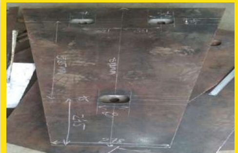
CHUTE LINER PLATE