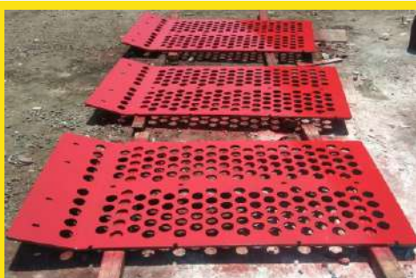
SCREENS FOR MOBILE CRUSHER