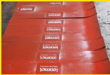
BUCKET BELLY LINER PLATE