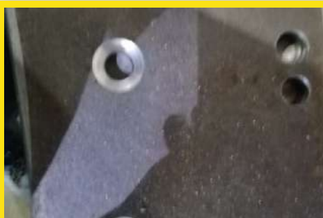
PLANETARY MIXER LINERS