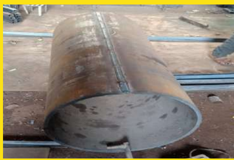
PIPES 535MM ID X 16MM - 500BHN