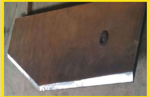
BUCKET LIP PLATE